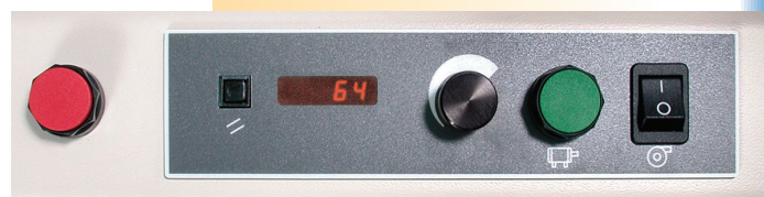
Folder Control Panel

Both units are equipped with interlocks for fault detection & safety, variable speed control and a five digit resettable counter for job auditing.